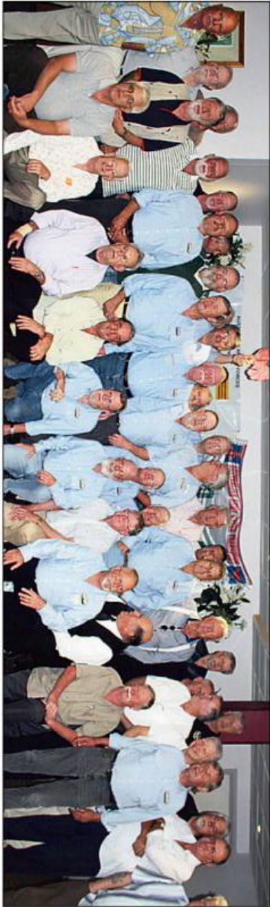
The mini-reunion group